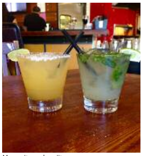
Margarita and mojito

he Hunt for Happy Hour series – bringing you information about the freshest and finest when it comes to discounted beverages and premium small plates in the Lamorinda area – continues this week with Table 24, an Orinda meeting place for the whole family.