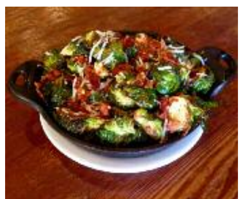
Roasted Brussels Sprouts

When: 3-5 pm, Monday-Sunday Where: Theatre Square, Orinda Drinks: $2 off wine, $6 well cocktails, $4 draft beer, $5 margaritas and mojitos Food: $5 Margherita pizzas,