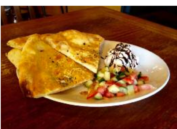
Petaluma burrata served with house-made flatbread

Happy hour specials include $5 no-fuss margaritas and mojitos, muddled and mixed